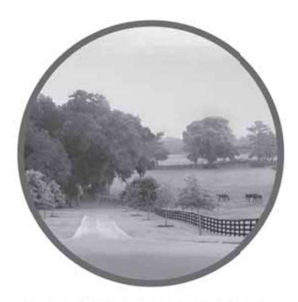
UNITED STATES EQUESTRIAN FEDERATION

The national governing body for equestrian sport