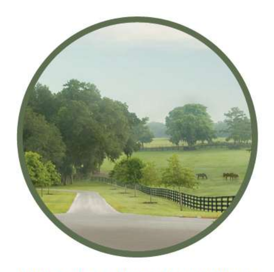
UNITED STATES EQUESTRIAN FEDERATION

The national governing body for equestrian sport