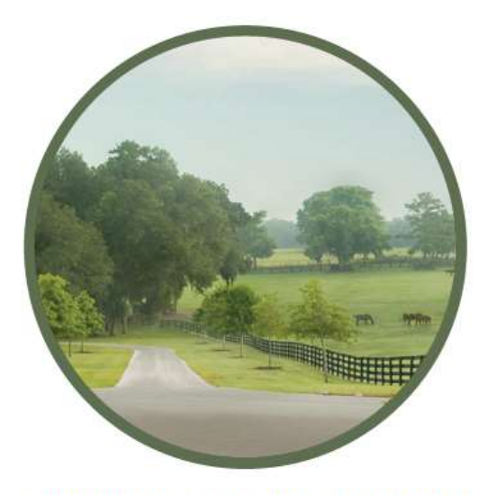
UNITED STATES EQUESTRIAN FEDERATION

The national governing body for equestrian sport